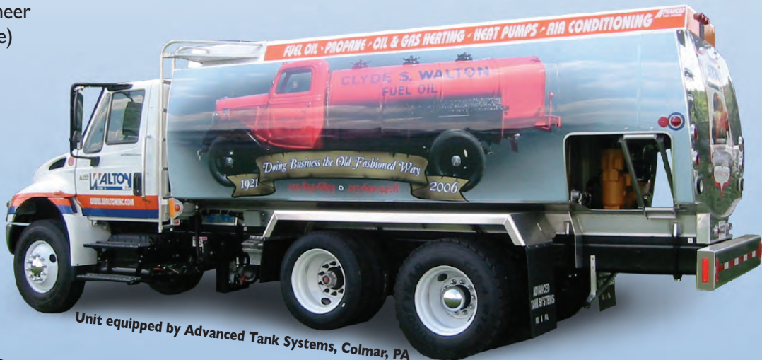
Unit equipped by Advanced Tank Systems, Colmar, PA

Experienced Local Distributors Who Understand Your Needs and the Importance of Quality Service to Keep Your Fleet Productive